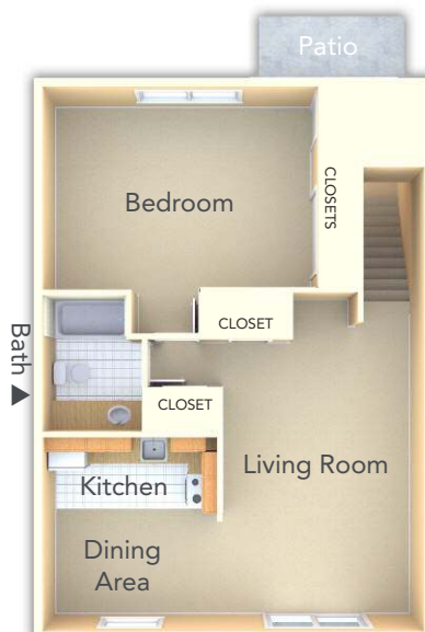
One Bedroom, Balcony