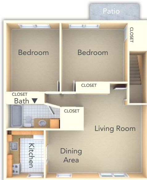
Two Bedroom, Balcony